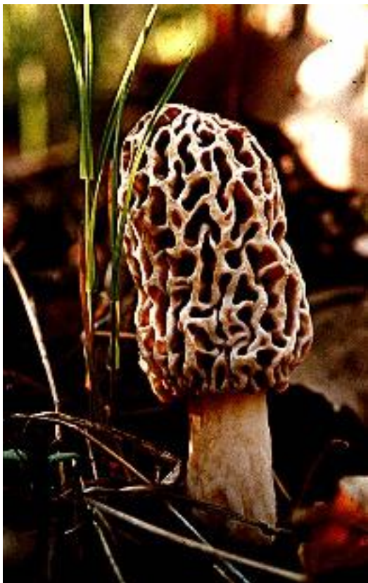
Morchella esculenta , the gray morel, which is probably the same as M. crassipes , pictured at the top of this page.

As far as species go, morel taxonomy is a big mess. In the midwest we have what I (and most people) believe are just three species of morels: