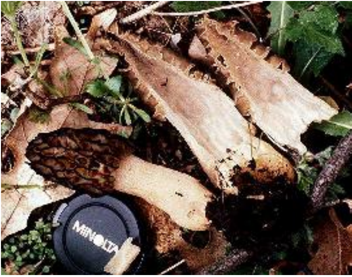
Morchella conica , the black morel.