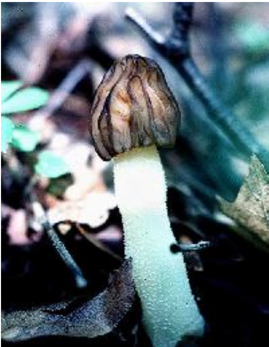
Morchella semilibera , the half-free morel.